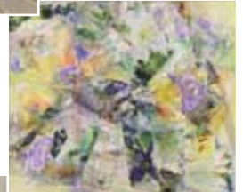
Untitled Collage, Christine Paringer