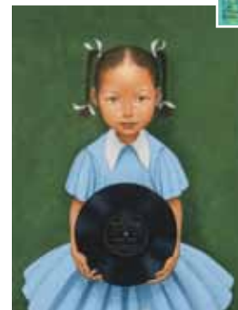
Mood Indigo, Kadir Nelson